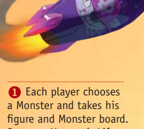
figure and Monster and takes his figure and Monster board. Set your Monster's Life Points (♥) to 10 and Victory Points (★) to 0.

6 Form a pool with all the Energy cubes (\frac{4}{7}) .