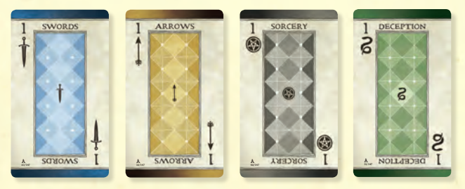
4 SUITS: SWORDS, ARROWS, SORCERY, AND DECEPTION – 15 cards each

Each Weapon suit has 11 STANDARD cards and 4 POISONED cards.