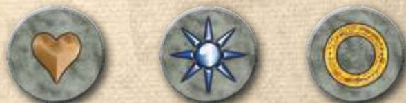
Heart Life Token Sun Life Token Ring Life Token

Each player must now have one of each of the three Life tokens, as evidence that his heart is in the right place (Heart Life token), that darkness is not overtaking him (Sun Life token), and that he is resisting the corrupting influence of the Ring (Ring Life token). For each token missing from his collection, he must move his Hobbit one space to the right on the Corruption Track. Extra Life tokens have no effect, so having two Sun Life tokens does not help a Hobbit any more than a single Sun Life token.