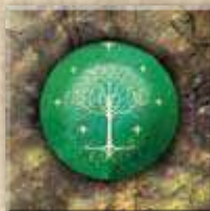
Story Tile Back

Example: A Story tile is revealed which shows a pipe (the symbol for Friendship). The marker on the Friendship Activity Track advances by one space, and the player resolves the space he lands in.